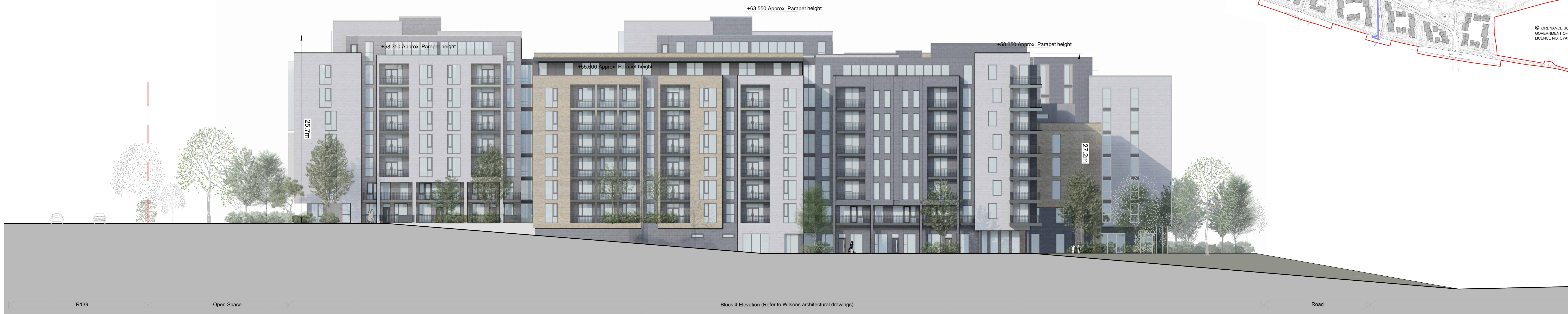
SECTION Z-Z 1/4