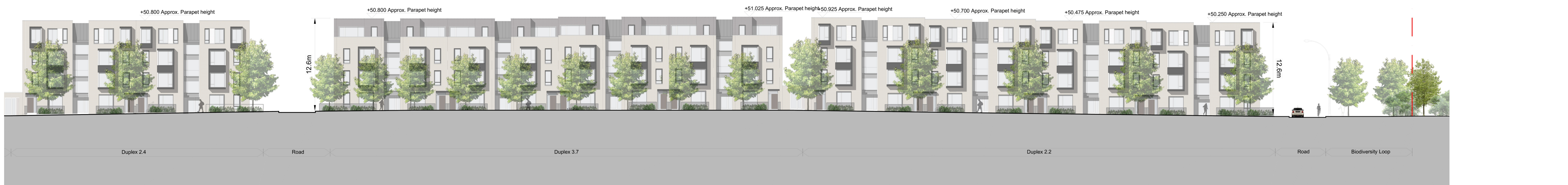
SECTION Z-Z Continued 4/4