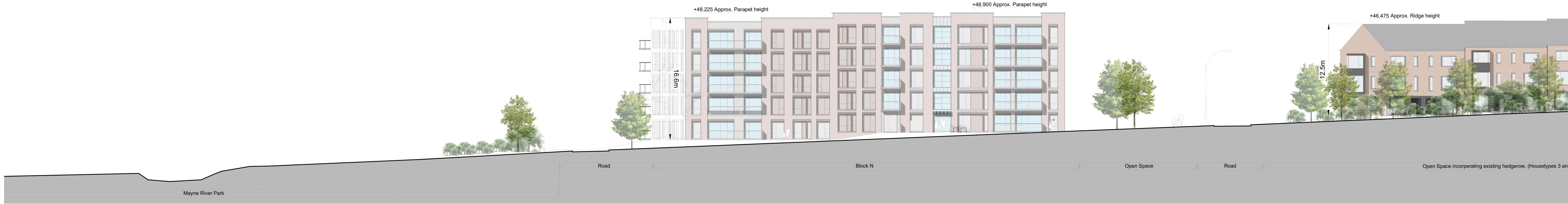
SECTION Z-Z Continued 2/4